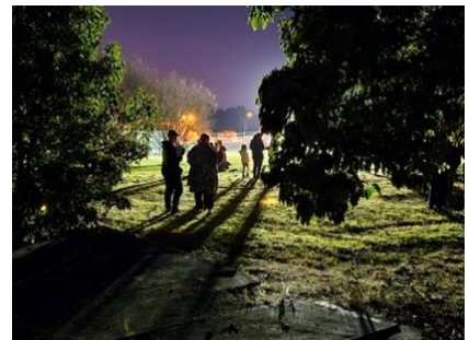
Top Row - Left: Community yarn discussing challenges and opportunities at the BNI, August 2023. Right: Buru (Eastern Grey Kangaroos) on the BNI site, May 2023. Middle Row – Left: Buru on Bells Creek in rain. Centre: Grandmother Tree. Right: Willy Wagtail. Bottom Row – Left: Janawi Dancing for local First Nations students, August 2023; Centre: Local students signing in to Country at the Grandmother Tree and their handprints on the tree, August 2023. Right: Dharug community members commemoration ceremony, August 2023