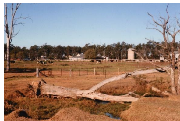
Undated historical views showing the BNI site during its use as a Dairy farm by Associated Dairies in the 1960s and 1970s. Note the extent of the clearance of trees from the site