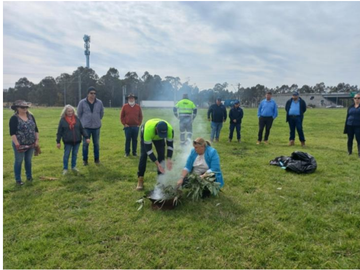
Smoking UMS Staff Training on Country at the BNI, September 2022