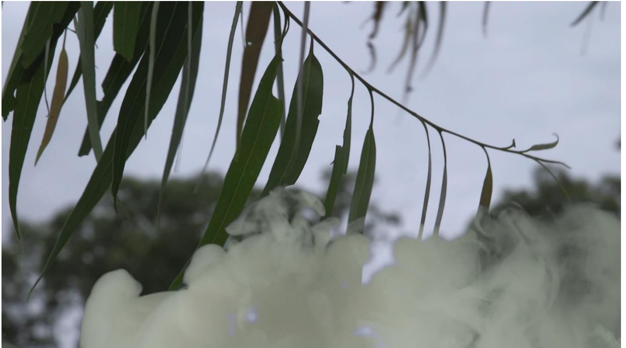
Morning smoke at the BNI