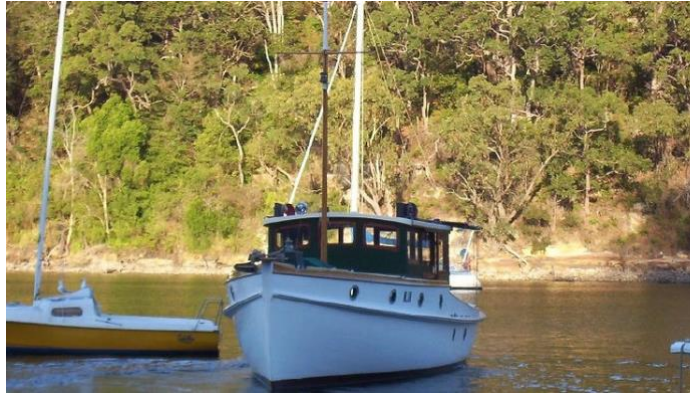
Koorabung , Aunty Chris Burke's beautiful timber river cruiser that Dharug women hope will be restored and operated as a modern 'nawi' (canoe) that will maintain and strengthen women's water knowledges, support training and employment of Dharug and other Indigenous people to run, maintain and operate the boat and develop river-centred caring for Country programs targeting schools, colleges, universities, tourists, government agencies and corporation